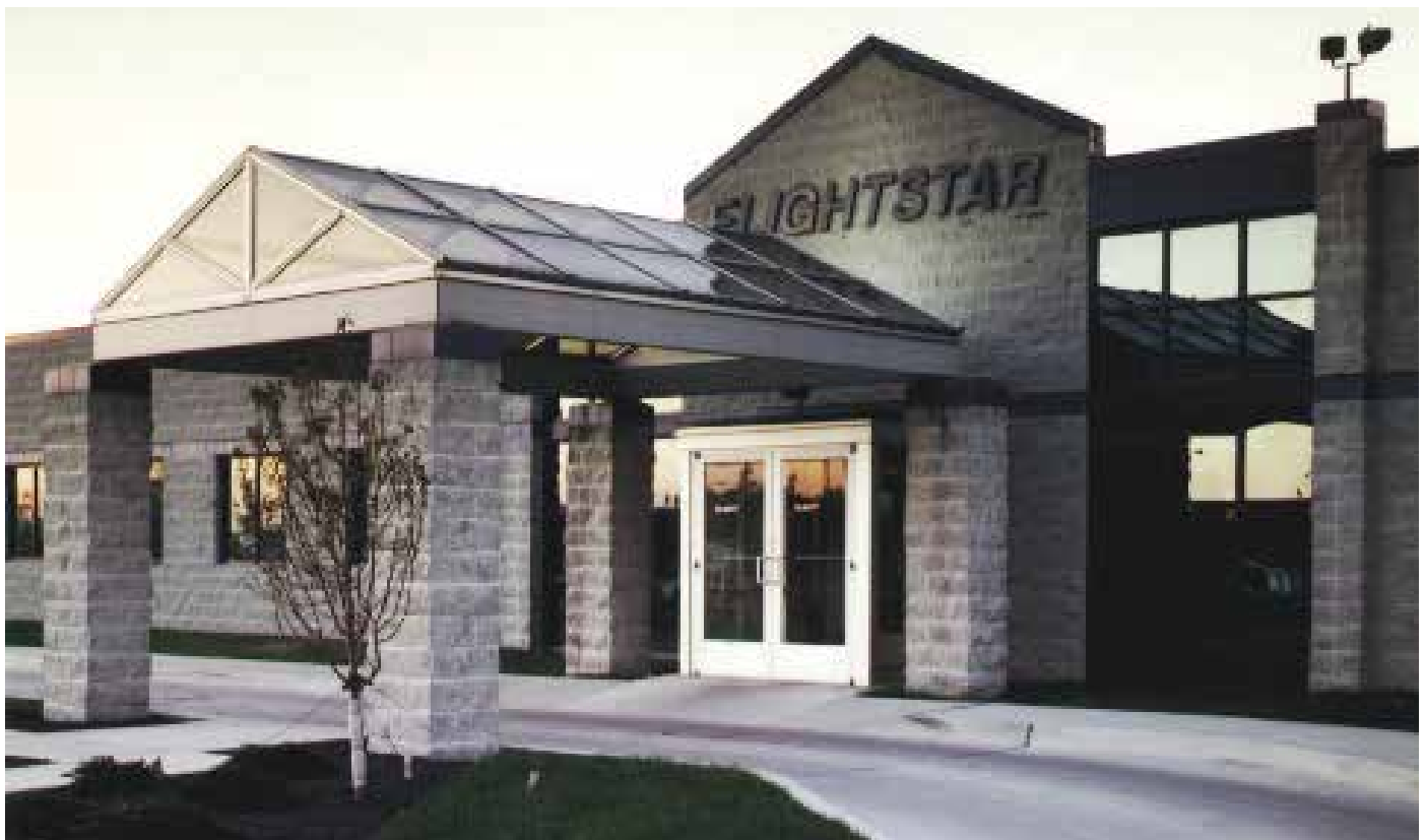
FlightStar, Champaign, Illinois. Site planning, architectural design, mechanical and electrical engineering by Henneman, Raufeisen and Associates. General contracting by Broeren Russo Construction.