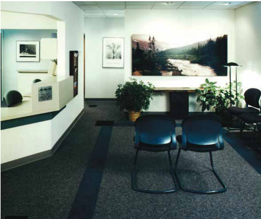
Mattis & Broadmoor Dental Office, Champaign, Illinois. Site planning and architectural design by Henneman, Raufeisen and Associates, Inc. General contracting and construction management by Broeren Russo Construction, Inc.