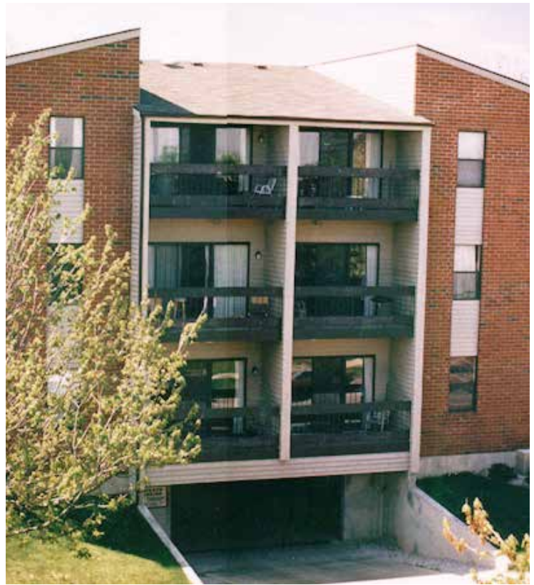
Royal Apartments, University of Illinois, Royal Properties, Champaign, Illinois. Site planning, architectural design, mechanical and electrical engineering by Henneman, Raufeisen and Associates. General contracting by Broeren Russo Construction, Inc.